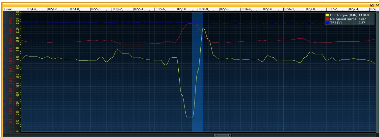
Figure 6: Shaft Dyno Plot: DriveGuardian Limiting Torque Spike to 1,130 ft-lb.

DriveGuardian was installed in the same boat as in the previous test (42’ Fountain) and run on Lake Michigan in a NOAA recorded wave height of 1’ with a southeast wind of 5-10 knots.