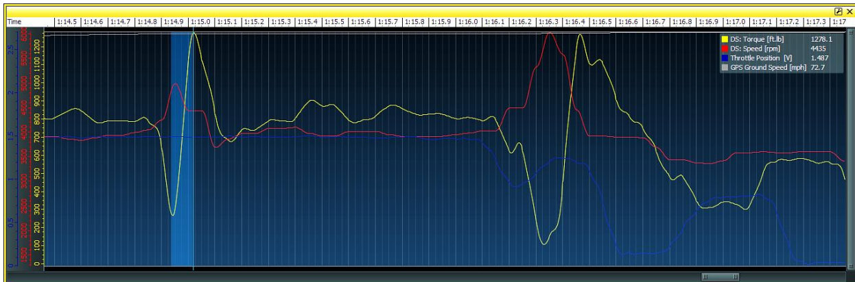
Figure 4: Shaft Dyno Plot: 1,278 ft-lb Torque Spike

At a test boat speed of approximately 65MPH, two torque peaks (yellow plot line) are visible in the Shaft Dyno output in Figure 3. Both of the spikes in Figure 3 are 60% more than the engine’s peak output and beyond the stern drives maximum input rating of 1,160 ft-lbs. It is interesting that the throttle position (blue plot line) at the peak of the torque-spike had very little effect on the severity of the spike. This makes sense if you recognize that the torque-spikes are a direct result of having a large mass (engine, flywheel, coupler, drive shaft, U-joints, gear sets, etc.) rotating at high RPM (red plot line) and then being suddenly slowed down by the propeller.