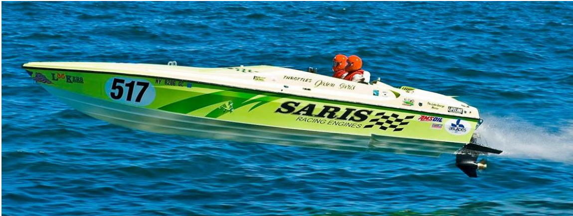
Figure 7: Team Saris Racing Engines, OPS Class 4

Marine Design Corporation partnered with Saris Racing Engines to conduct a long-term test of the effectiveness of the DriveGuardian System. Team Saris races in OPA's Class 4 and runs a 32' Cobra weighing in at approximately 8,500lbs with twin 650HP engines and stock Bravo XR drives. The OPA racing circuit includes some open ocean races that are historically some of the roughest offshore race venues in the United States, which was the perfect testing ground for DriveGuardian.