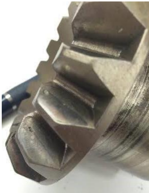
Figure 8: Team Saris Racing Engines, Bravo XR Upper Gear – 3 Races with Stock Coupler

Prior to installing DriveGuardians, Team Saris was replacing their Bravo XR upper gears every 3-4 races due to excessive pitting on the face of the teeth. Evidence of the pitting was showing up as metal particles on the lower drain plug magnet. Once the pitting starts it will propagate rapidly leading to complete gear failure and must be replaced immediately.