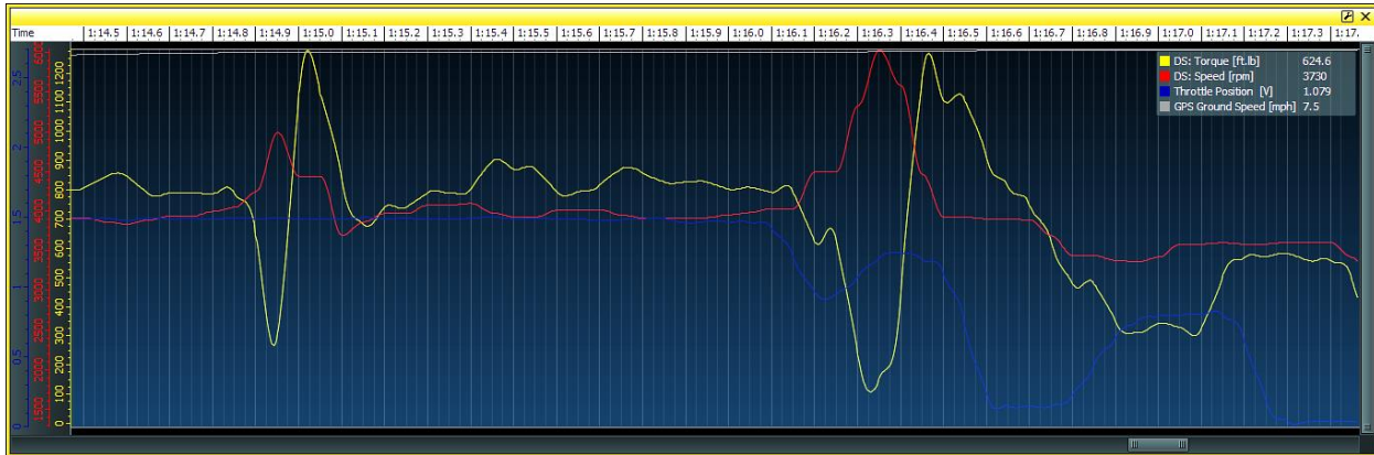
Figure 3: Three Second Snapshot Shaft Dyno Data

This test was conducted in 1'-3' waves (per the NOAA near shore forecast) on Lake Michigan, with Northwest winds at 10-15 knots. The purpose was to confirm the existence of torque spikes and to measure the peaks and durations of the Synchronization Events.