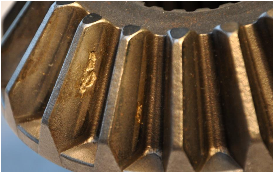
Figure 1: Tooth Damage on a Mercury Racing SSMVI Pinion Gear

The worst case scenario is that the torque spike is severe enough to break a tooth off one of the gears and become jammed between the gears, which will most likely cause the housing to break open and result in catastrophic failure.