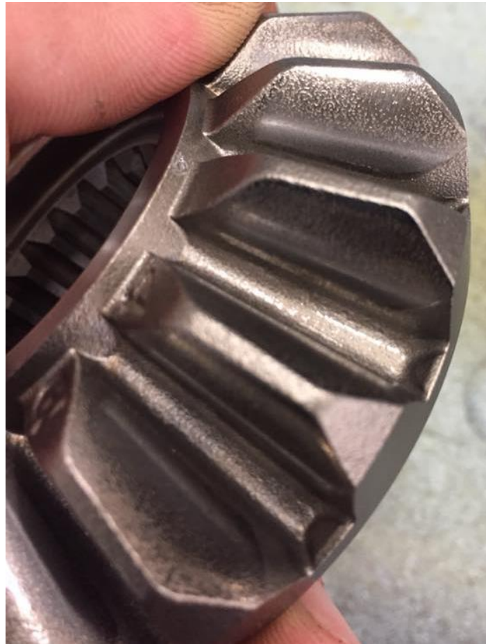
Figure 9: Team Saris Racing Engines, Bravo XR Upper Gear – 12 Races with DriveGuardian

Since installing DriveGuardians, the team runs an entire season on their drives and the only maintenance that has been required is to change the Mercury Racing Hi Performance gear lube. Below is a stock Bravo XR gear that Team Saris ran for 12 races across two seasons. This gear shows normal wear with no evidence of pitting and has since been re-installed in the drive. We will report on it's condition after the next inspection point.