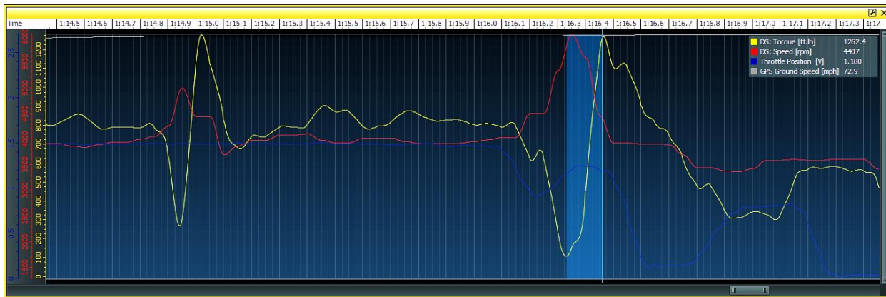
Figure 5: Shaft Dyno Plot: 1,262 ft-lb Torque Spike

Table 1 is the results of a mathematical model of the 1,278 ft-lb torque spike that is highlighted in Figure 4. Based on the 1.52:1 gear ratio for the drive, you can see that the propeller shaft sustained an even greater torque spike of 1,918 ft-lbs.