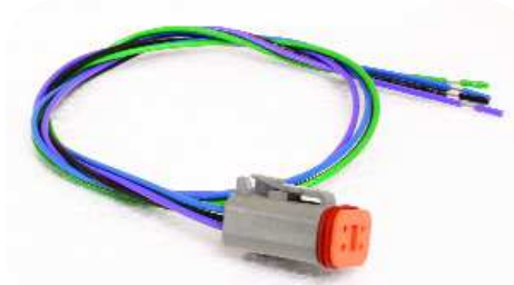
Part # DCH Four pin connector & wire harness

for use on Mega & Race Series Electric gauges & Tachometers